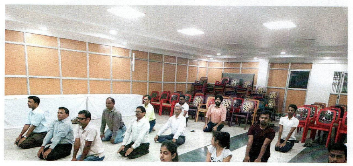
Fig: 09/11/2017: Participants practicing Yoga under the guidance of the experts